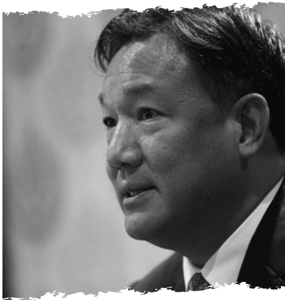
H.E. Mr. Kittiratt Na-Ranong

A number of prominent speakers will be invited from both countries and the main speaker is none other than H.E. Mr. Kittiratt Na-Ranong, the current Deputy Prime Minister and Minister of Finance of Thailand, a direct descendant of Khaw Sim Kong.