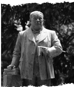
Khaw Sim Bee's statue

Khaw Sim Bee almost single-handedly saved the economy of southern Siam by introducing rubber cultivation at a time when tin industry was hit by dwindling supplies and falling prices in early 20th century. He started rubber tree planting in Trang and persuaded the local officials to distribute rubber seeds to more farmers. Chinese immigrants who arrived in Phuket to work in the tin mines switched to rubber tapping and in turn helped to expand the local rubber industry. The rubber was exported through Penang port to meet the industrial demands of Britain. Khaw Sim Bee is always being remembered as the Father of the Rubber Industry in Thailand.