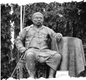
Khaw Soo Cheang's statue